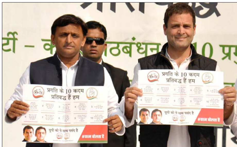
Uttar Pradesh Chief Minister Akhilesh Yadav and Congress vice president Rahul Gandhi releasing 10-point common minimum programme of the alliance during the ongoing Uttar Pradesh assembly polls, in Lucknow.

With just weeks to go before May is expected to formally announce Britain's intention to leave the EU by triggering article 50, Verhofstadt also dashed the UK government's hopes that it will be able to conduct negotiations in tandem about withdrawal and a future trade agreement with the EU.