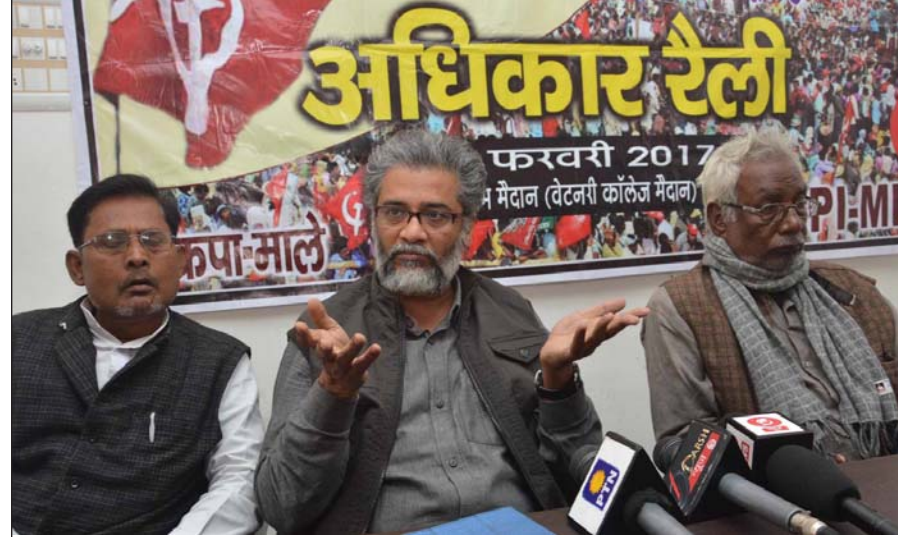
CPI-ML General Secretary Dipankar Bhattacharya addressing a press conference in Patna.