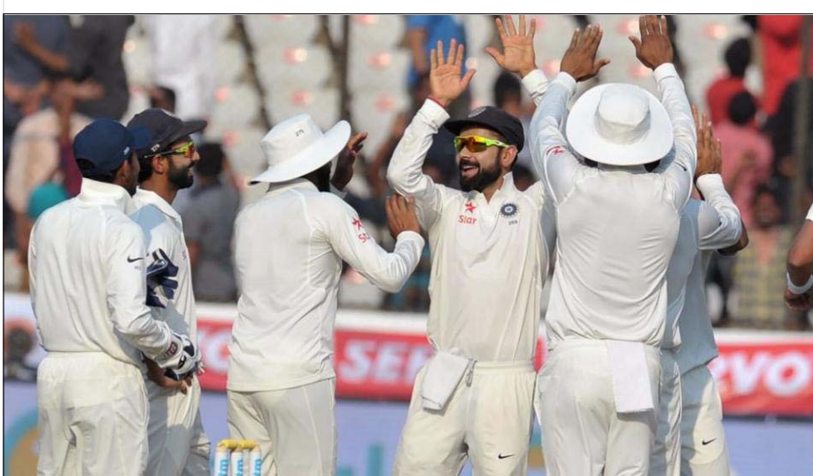
India captain Virat Kohli celebrates with teammates the wicket of Bangladesh's Soumya Sarkar on Day 2 of the Hyderabad Test on Friday. Live streaming and live cricket score of India vs Bangladesh is available online.

goal, in the same minute, Lancers skipper Furste equalised the score-line via a penalty corner which he slammed to the left bottom corner.