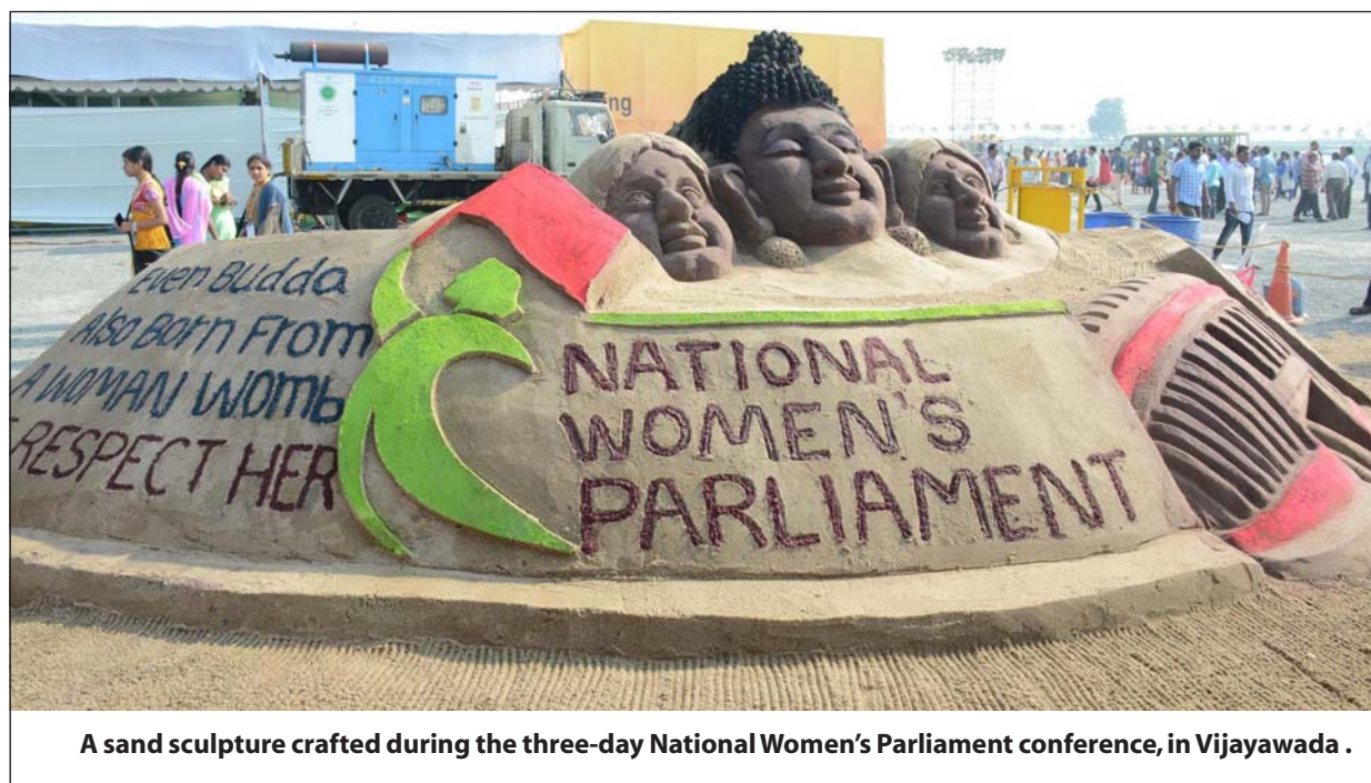
A sand sculpture crafted during the three-day National Women's Parliament conference, in Vijayawada.