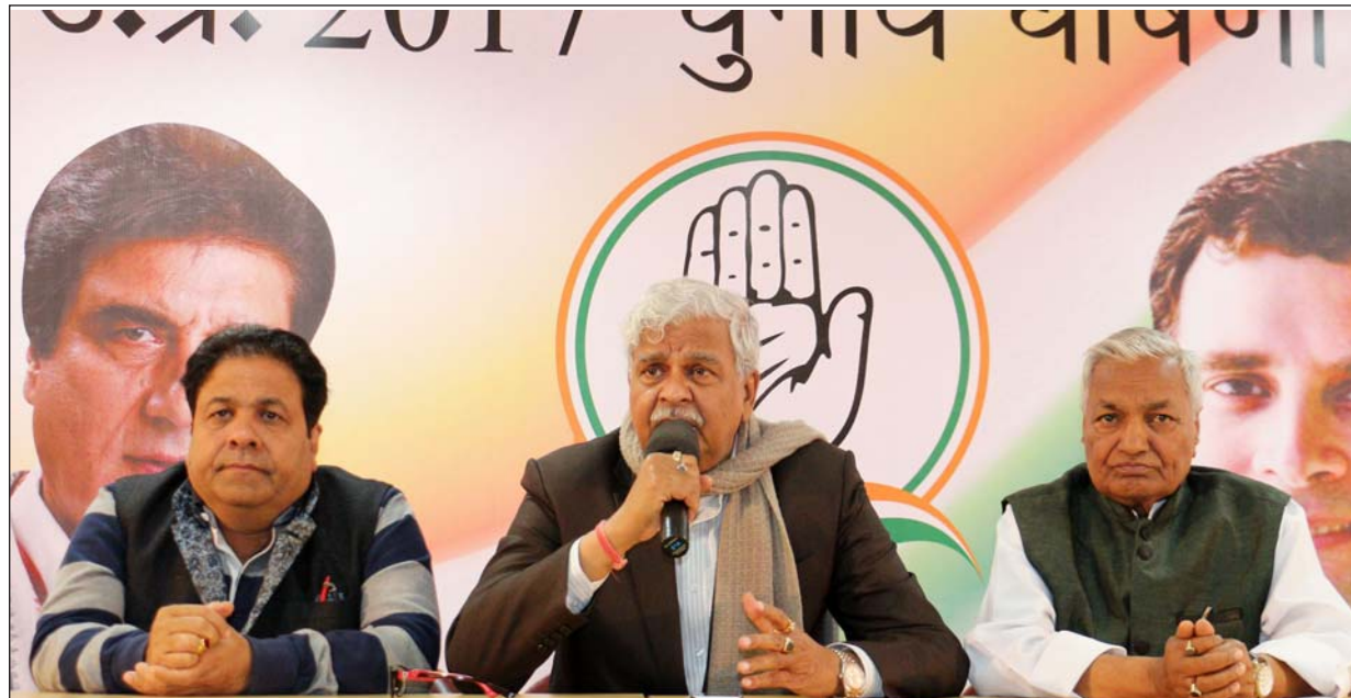
Senior Congress leaders Sriprakash Jaiswal and Rajiv Shukla addressing a press conference in Lucknow.

They were accused of planting as tiffin the five bombs that were found on May 29, 2002 in public transport buses run by Ahmedabad Municipal Transport Service (AMTS). Three of these bombs had exploded injuring 13 people. The blasts were seen as retaliation for the 2002 communal riots.