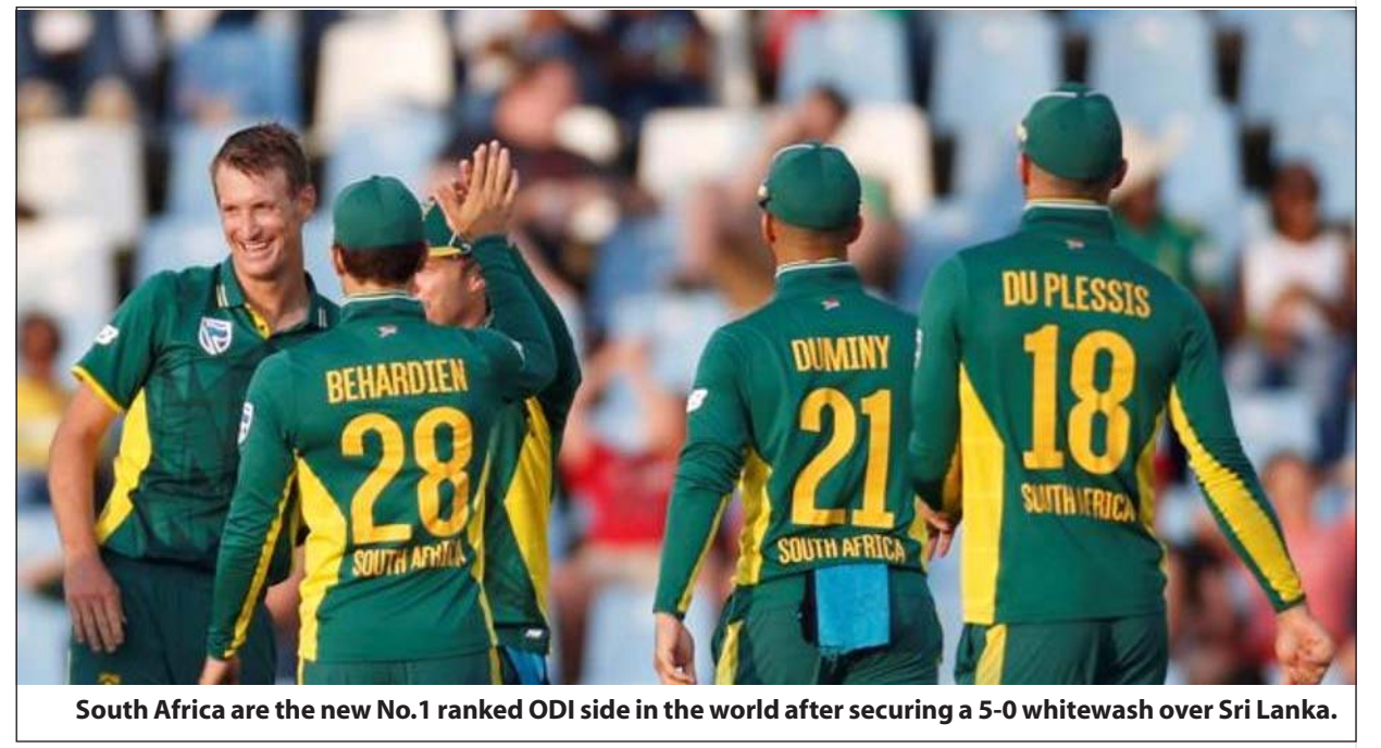
South Africa are the new No.1 ranked ODI side in the world after securing a 5-0 whitewash over Sri Lanka.

Rio de Janeiro, Chinese football club Beijing Guoan has made a bid to sign former Brazil striker Jonas Oliveira, according to media reports.