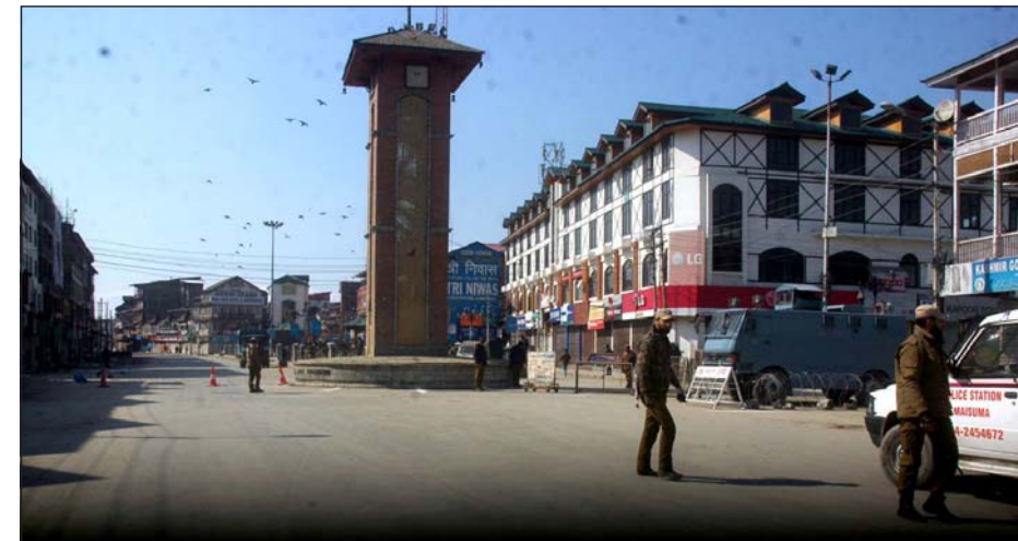
Security personnel deployed at Lal Chowk in Srinagar as security arrangements were beefed up following separatists' call to march to United Nations Military Observers Group for India and Pakistan at Sonwar from the business hub which forced authorities to impose curfew like restriction at many areas of Sher-e-Khas and down town.

NASA said ground-based observations also are planned for comet 41P/Tuttle-Giacobini-Kresak, which will pass closest to Earth on April 1, 2017, and for comet 46P/Wirtanen, passing closest to Earth on December 16, 2018.